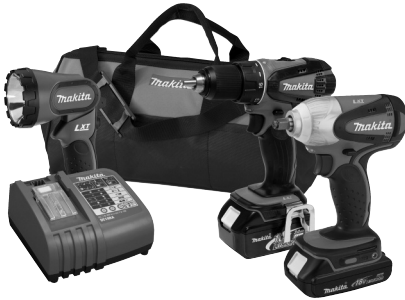
LXT311H 18V LXT Lithium-Ion Cordless 3-Pc. Combo Kit Juego Combinado Inalámbrico de 3 ps. LXT Lítio-Ion de 18V