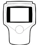
NGIS Scan Tool (not included as part of this offer).